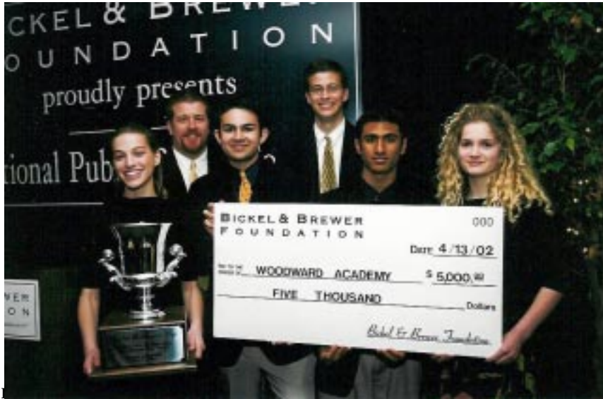
Students from Woodward Academy, College Park, (GA) won $5,000.

We all know the feeling of being involved in a debate. But imagine having that same argument in front of some of the world's foremost experts in government, journalism and law. That's the opportunity that was made available recently to high school students who competed in the Bickel and Brewer foundation National Public Policy Forum.